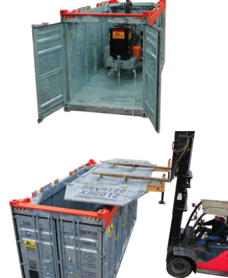
SIDE VIEW 6058 mm [240"] [20']