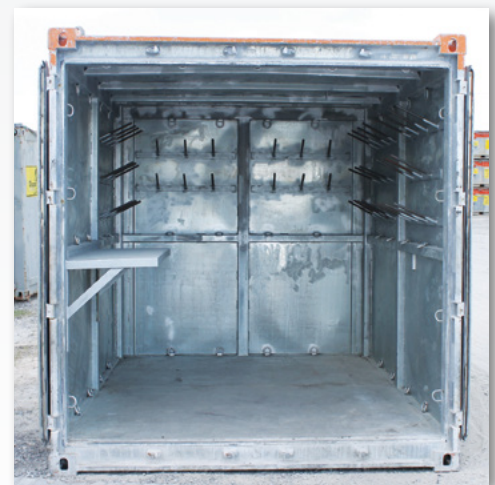
Job Box Upgrade: Shelves, hangpins and lights.